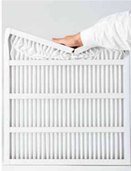
As a result of its unique design, PerfectPleat can withstand significant damage.