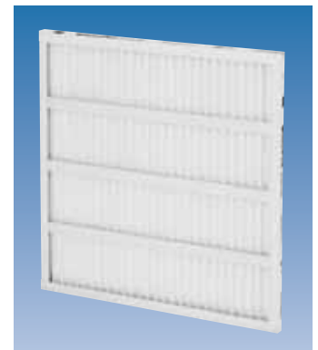
PerfectPleat HC 1" air entering side.

The 1" PerfectPleat HC and PerfectPleat have the same durability and performance as the 2" models. Both are made using DuraFlex media encased in a 28 pt. beverage carrier board frame. PerfectPleat 1" models feature a perimeter frame, with three supporting straps on the air entering and air leaving sides of the filter. Both models resist crushing and abuse and can be used in any application where 1" filters are currently in place. PerfectPleat HC and PerfectPleat are rated MERV 7.