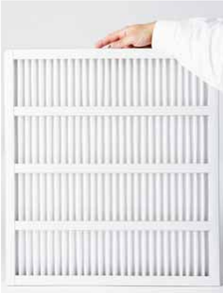
PerfectPleat with DuraFlex media produces a filter with excellent form and fit.