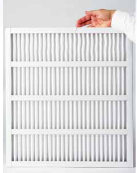
DuraFlex media has "memory" which allows PerfectPleat to remain functional, even when the frame has been compromised.